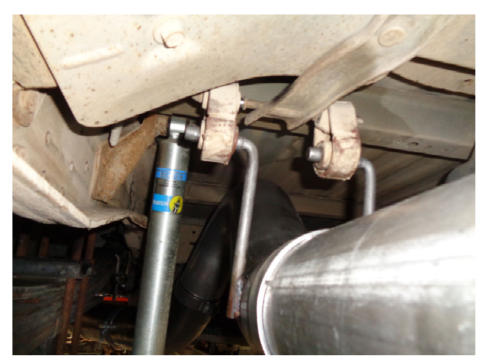
Step 4. Loosely install the Y-Collector and Over Axle Pipe Assemblies using the supplied clamps. Locate both welded hangers to the rubber insulators.