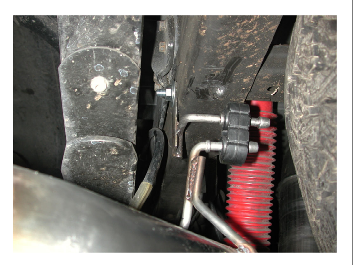
Step 5. Install the hanger bracket on the driver's side using the predrilled hole in the frame as shown.