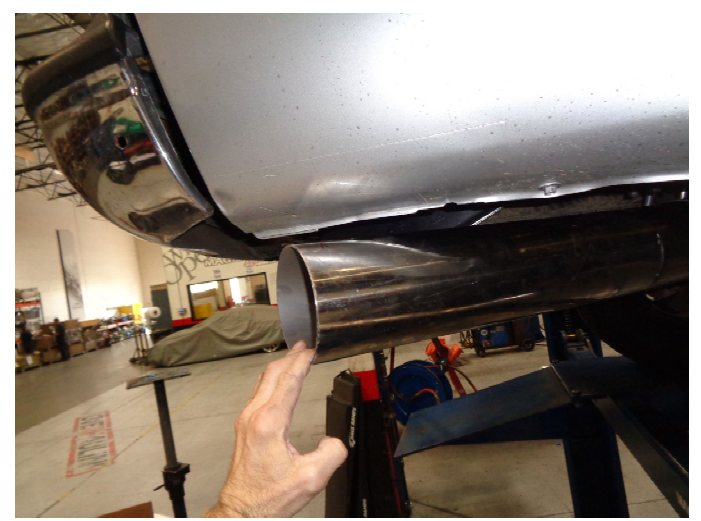
Step 6. Install the Tail Pipe Assembly in the same way. The Outlet may be trimmed as desired.