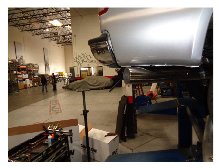
Step 7. Once a final position has been chosen for the new exhaust system, evenly tighten all clamps from front to rear using the torque specifications on page one of the instructions. Inspect all fasteners after 25-50 miles of operation and re-tighten if necessary.