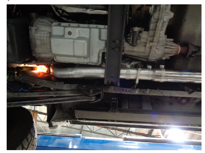
Step 2. Install the corresponding Inlet Pipe Assembly and loosely fasten it to the turbo charger outlet using the OEM clamp. Next, loosely attach the Inlet Pipe Lower Assembly to the Inlet Pipe Assembly using the supplied clamp. Refer to the table below to select the appropriate extension pipes for your vehicles configuration.