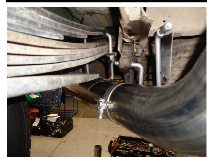
Step 3. As you assembly the Extension Pipes loosely locate the Hanger Clamp Assemblies as needed.