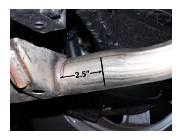
2. To remove stock exhaust, measure 2.5" from exhaust hanger located before the 2bolt flange. See picture. Remove stock exhaust from the 3 rubber hangers. Use WD-40 to aid in removal.

1. Disconnect the negative battery cable before removal of OEM exhaust. This will allow the computer to reset and recognize the new exhaust. Lay out the exhaust on the floor so it looks like the drawing and compare parts with manual.