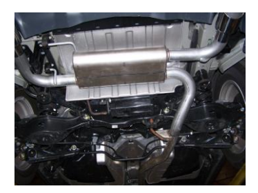
3. Install muffler assembly onto factory pipe. Insert hangers into rubber grommets. Use clamp #B to secure pipes together. Do not tighten.