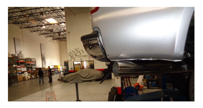
Step 6. Once a final position has been chosen for the new exhaust system, evenly tighten all clamps from front to rear using the torque specifications on page one of the instructions. Inspect all fasteners after 25-50 miles of operation and re-tighten if necessary.