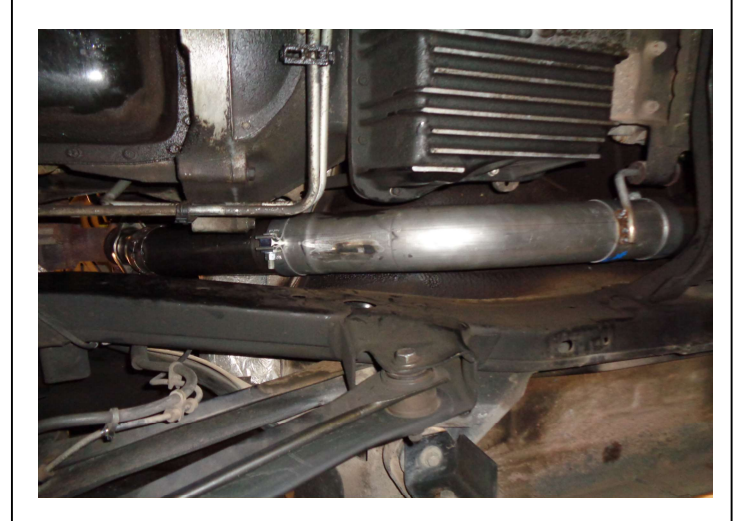
Step 2. Install the corresponding Inlet Pipe Assembly and loosely fasten it to the turbo charger outlet using the OEM clamp. Next, loosely attach the Inlet Pipe Lower Assembly to the Inlet Pipe Assembly using the supplied clamp. Refer to the table below to select the appropriate extension pipes for your vehicles configuration.