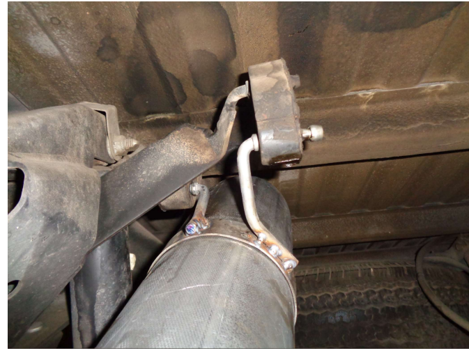
Step 4. Loosely install the Over Axle Pipe Assembly using the supplied clamps. Locate both hangers to the rubber insulators.