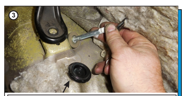
Position 3 bolt is located under the front seat next to the rear mounting point. Remove the 4 mounting bolts and lift the seat up and pull up carpet and remove the black round plug. Black round plug already removed.