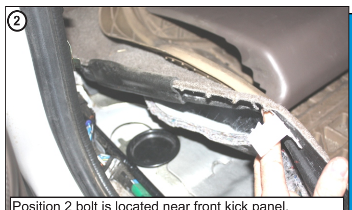
Position 2 bolt is located near front kick panel. Remove the plastic door trim and kick panel, pull up carpet and remove the black round plug.