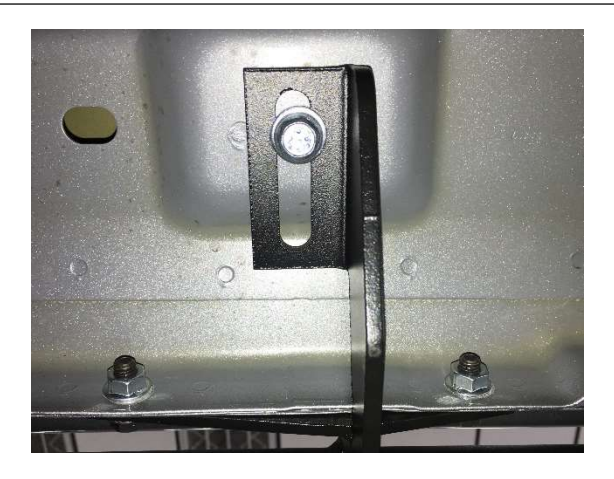
Step 10. Repeat steps 3-9 for the passenger side.