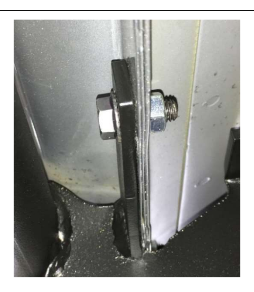
Step 9. Next, tighten the remaining hardware that attaches the bracket to the upper body mount.

Step 8. First, tighten all the hardware that attaches the bracket to the pinch weld of the vehicle.