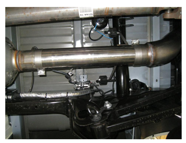
Step 3. The longer Inlet Pipe Extension will be needed for Long Bed applications only.