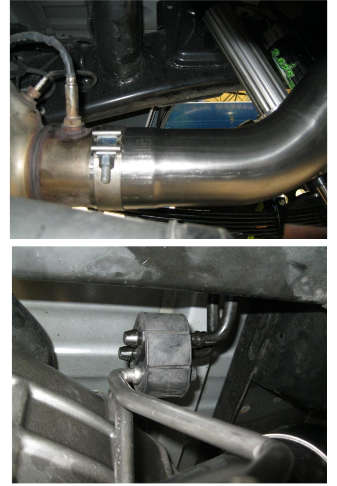
Step 2. Begin installation of the Magnaflow system by clamping the Inlet Pipe to the outlet of the DPF using a supplied 4.00" clamp and fitting the hangers in the rubber insulators (leave all clamps loose for final adjustment of the complete system).

Step 1. Begin removal of the OEM system by unclamping the OEM Extension Pipe and muffler from the junction behind the DPF. You can then disengage the welded hangers from the rubber insulators, working rearward finish removing the system. Do not damage or discard the rubber insulators or sensor bracket and fastener, as they will be reused to mount the new system.