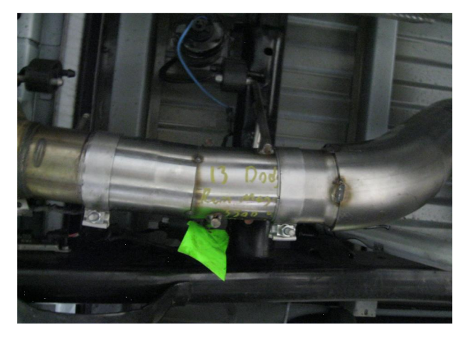
Step 5. The shorter Inlet Pipe Extension will be needed for all Mega Cab applications.

MAGNAFLOW: 22961 Arroyo Vista - Rancho Santa Margarita, CA 92688 | 1(800) 990-0905 Technical Support: 1(800) 959-9226 | Email: moreinfo@magnaflow.com