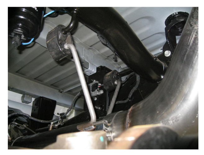
Step 4. When using the long bed extension pipe attach the OEM cable bracket using the OEM bolt.