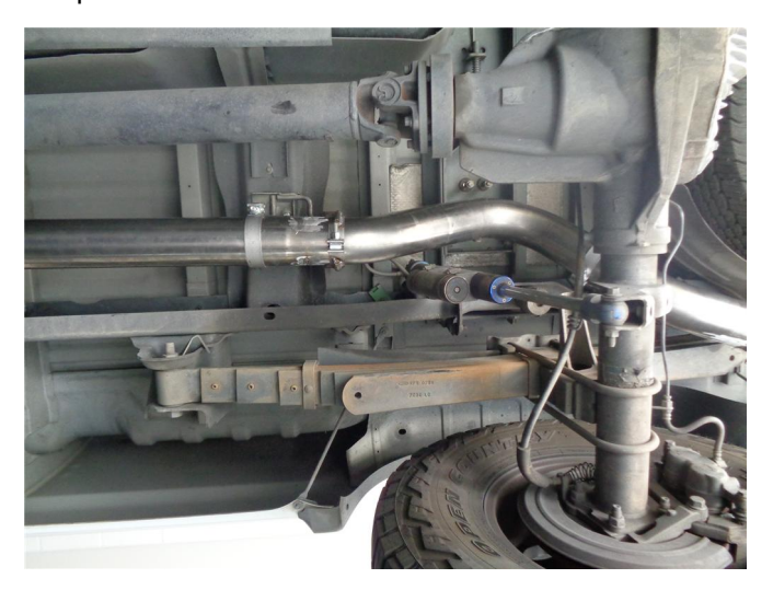
Step 4. Loosely install the Over Axle Pipe Assembly using the supplied clamp. Remove the sensor plug for 6.7L application. Loosely slip the Hanger Clamp Assembly over the pipe and locate the welded hangers to the rubber insulators.