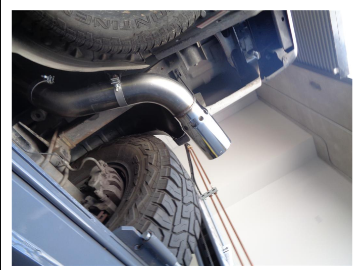
Step 5. Loosely slip the Hanger Clamp Assembly over the Tail Pipe Assembly. Loosely install the Tail Pipe Assembly using the supplied clamp. Engage the welded hanger to the rubber insulator.