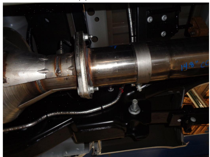
Step 3. Begin installation by loosely attaching the Inlet Pipe Assembly to the OEM flange outlet using the OEM hardware (6.7L), or loosely attach the Inlet Adapter to the DPF outlet using the supplied clamp (6.4L). Loosely attach the Extension Pipe, if needed, using the supplied clamp.