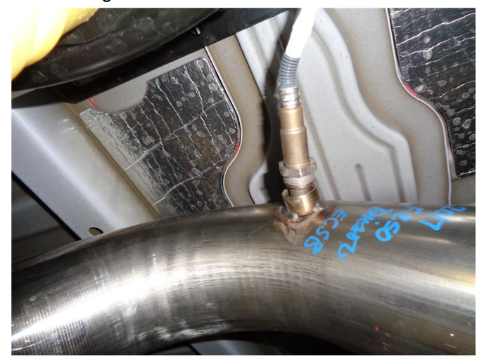
Step 6. Reattach the O2 sensor (6.7L only).