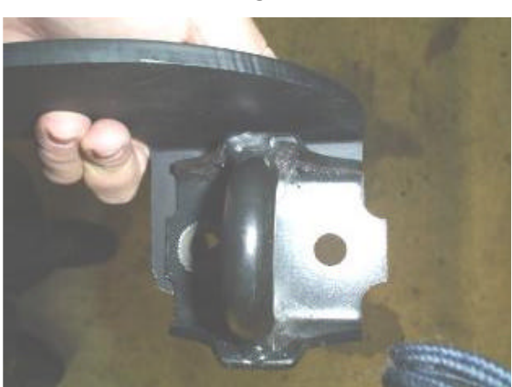
Bracket and tow hook. Passenger side.