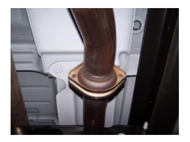
2. To remove your stock exhaust, unbolt the 2-bolt flange located in front of the muffler. Disengage the welded hangers from the rubber grommets. Use WD-40 to aid in this process. Do not remove or damage the rubber grommets as you will reuse them to mount your new system. Now, cut off tailpipe and remove exhaust. Do not throw away stock hardware.

1. Disconnect the negative battery cable before removal of OEM exhaust. This will allow the computer to reset and recognize the new exhaust. Lay out the exhaust on the floor so it looks like the drawing and compare parts with manual.