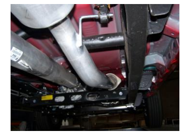
3. Install headpipe #A onto your existing stock front headpipe using stock hardware to secure pipes together. Do not tighten. Insert welded hangers into rubber grommets.

6. Install metal hanger #I into hole located in front of the rear leaf spring stock mount.