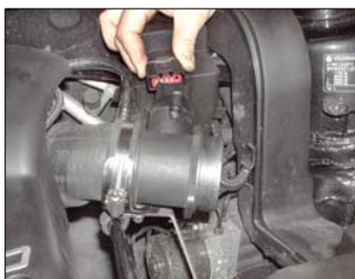
Fig. # 9