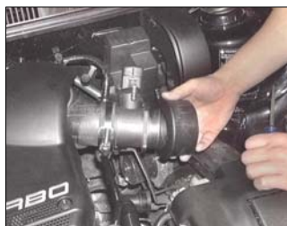
Fig. # 10