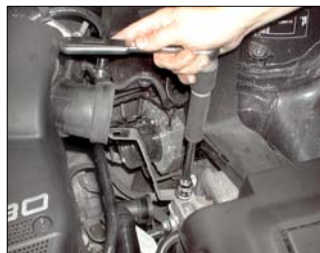
Fig. # 6