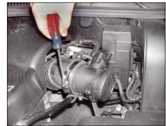
Fig. # 8