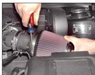
Fig. # 11