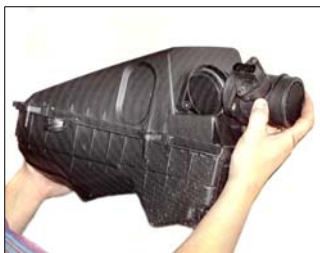
Fig. # 5