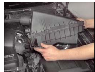
Fig. # 4