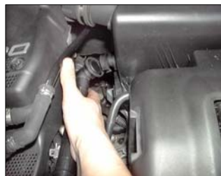
Fig. # 3