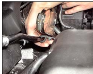
Fig. # 7