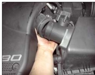
Fig. # 2