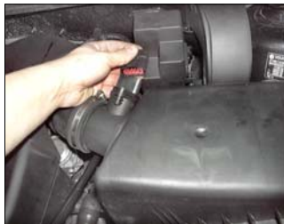
Fig. # 1

WARNING: Before starting the engine carry out a final fitment check of the K&N performance kit. It will be necessary for all intake systems to be checked periodically for realignment, clearance and tightening of all connections. Failure to follow the above instructions or proper maintenance may void the warranty.