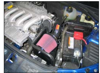
Fig. # 16