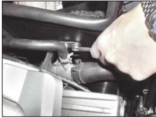
Fig. # 9

Renault Clio 172 2.0L 16v 172bhp Jan'00-Apr'01