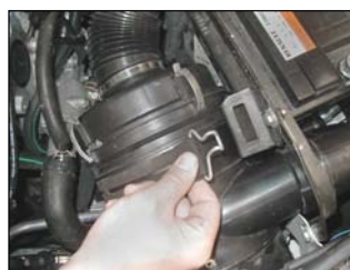
Fig. # 3