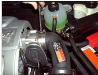
Fig. # 14