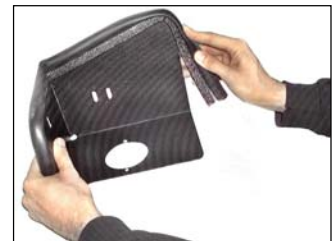
Fig. # 8