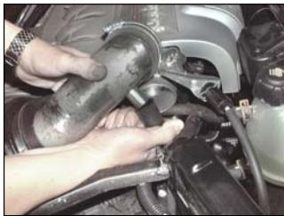
Fig. # 13