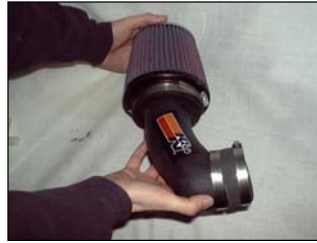
Fig. # 11