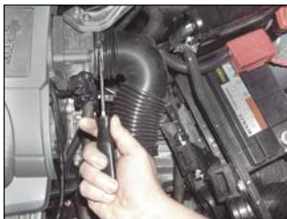
Fig. # 1

WARNING: Before starting the engine carry out a final fitment check of the K&N performance kit. It will be necessary for all intake systems to be checked periodically for realignment, clearance and tightening of all connections. Failure to follow the above instructions or proper maintenance may void the warranty.