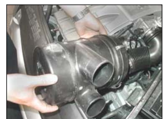
Fig. # 4