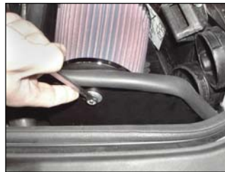
Fig. # 15