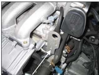
Fig. # 5