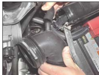
Fig. # 2