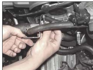
Fig. # 6