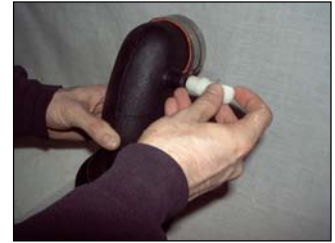
Fig. # 12