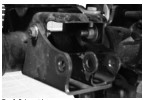
Fig. 2: Driver side