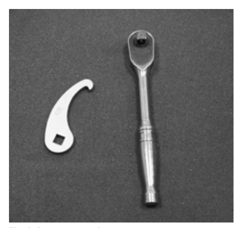
Fig. 6: Spanner wrench