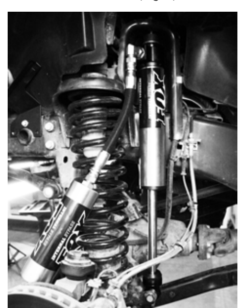
Fig. 3: Driver side