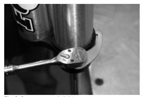
Fig. 8: Spanner wrench tighten