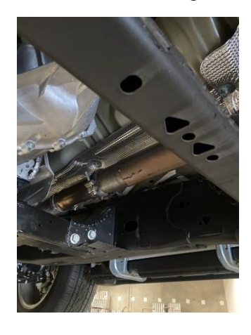
3. INSTALL HEADPIPE #A ONTO STOCK PIPE. INSERT WELDED HANGER INTO RUBBER GROMMET. (You Will be reusing the factory head pipe clamp.)