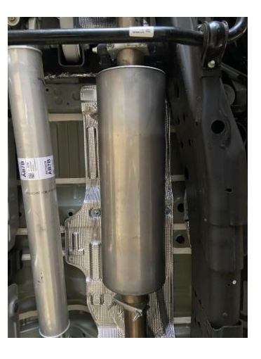
4. INSTALL MUFFLER #B ONTO HEADPIPE, USE CLAMP #D TO SECURE MUFFLER TO HEADPIPE. DO NOT TIGHTEN. USE A JACK STAND TO HOLD UP THE MUFFLER.