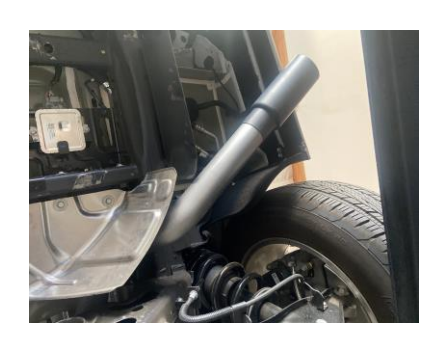
5. Finally, over axle pipe #C can be installed using the Band Clamp #D. Install the Tip to help set the over axle pipe height. (Tighten all clamps working from front to back.)