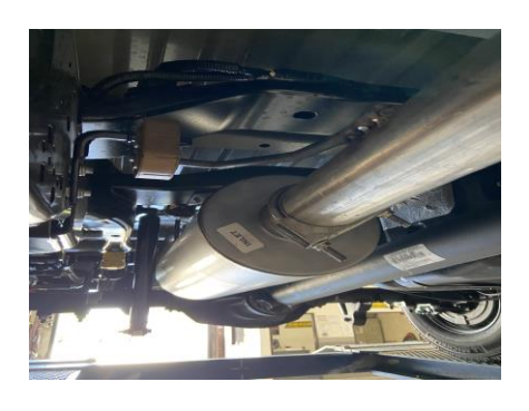
4. Install the Muffler #D onto the new Head Pipe using clamp #C. Leave clamps loose enough to have a little play.