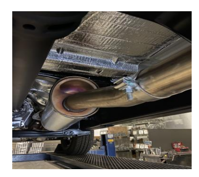
2. To remove the stock exhaust loosen the clamp from the back of the resonator. Then remove the spare tire and heat shield to aid in removal. Disengage the welded hanger using WD-40 from the OEM rubber grommets. Do not damage or remove the rubber grommets as you will reuse it to mount your new system.

1. Disconnect the negative battery cable before removal of OEM exhaust. This will allow the computer to reset and recognize the new exhaust. Lay out the exhaust on the floor so it looks like the drawing and compare parts with manual.