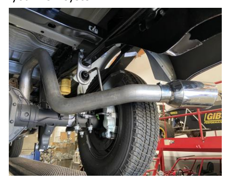
5. Now you may install the Over Axle Pipe #B into the muffler using Clamp #C. Then install the Tip onto the over axle to your desired location and tighten all clamps working front to back.