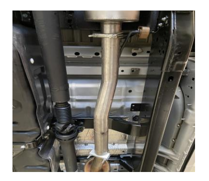
3. Install Head Pipe pipe #A onto your existing stock pipe coming out of the Resonator and attach with clamp # C. Keep the clamp a little loose.