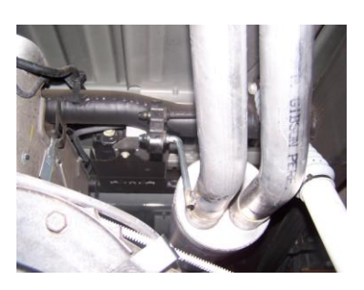
SLIDE DRIVERS SIDE TAILPIPE #D INTO MUFFLER 1-1/2" TO 2". INSERT WELDED HANGER INTO RUBBER GROMMET.