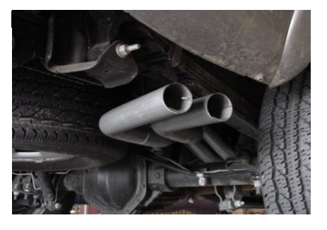
USE BOLT KIT #J TO SECURE TAILPIPES TOGETHER. THE PASSENGER SIDE TAILPIPE WILL BE ON THE BOTTOM.