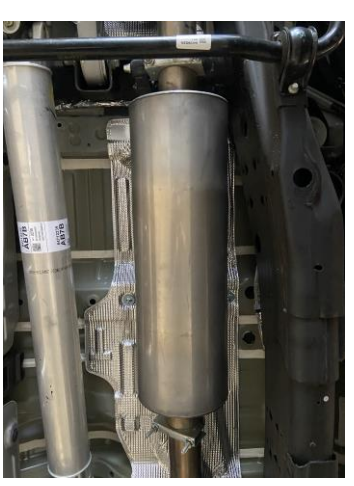
4. INSTALL MUFFLER #B ONTO HEADPIPE, USE CLAMP #D TO SECURE MUFFLER TO HEADPIPE. DO NOT TIGHTEN. USE A JACK STAND TO HOLD UP THE MUFFLER.

3. INSTALL HEADPIPE #A ONTO STOCK PIPE. INSERT WELDED HANGER INTO RUBBER GROMMET. (You Will be reusing the factory head pipe clamp.)