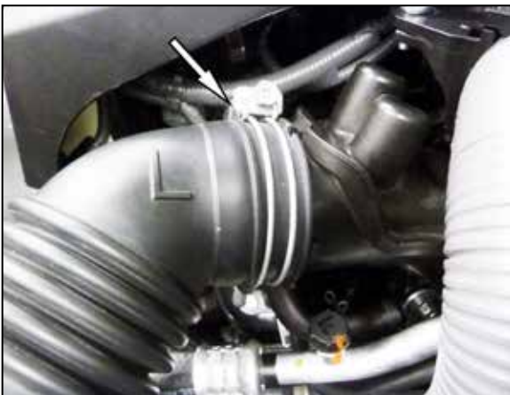
4. Loosen the hose clamps that secure the factory upper intake tubes to the turbo inlet manifolds and then remove the upper housings, intake tubes and filters.