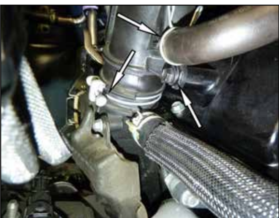
5. Disconnect the PCV hose from the passenger side lower intake tube, Remove the intake tube mounting bolt then loosen the hose clamp securing the intake tube to the turbo inlet and remove the tube from the vehicle.