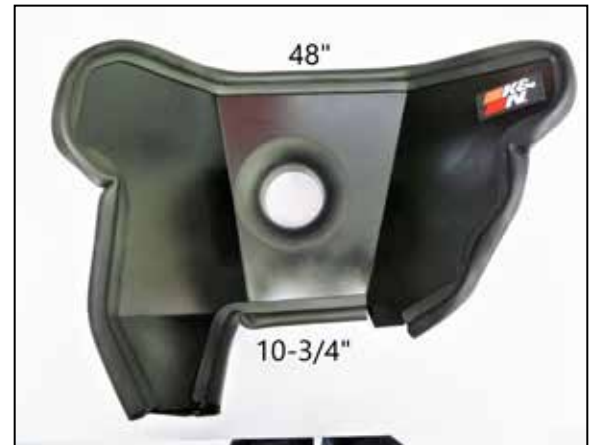
11. Cut the 61\"/>