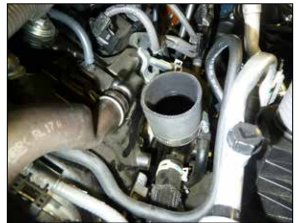
9. Install the provided couplers onto the turbo inlets and secure with the provided hose clamps.