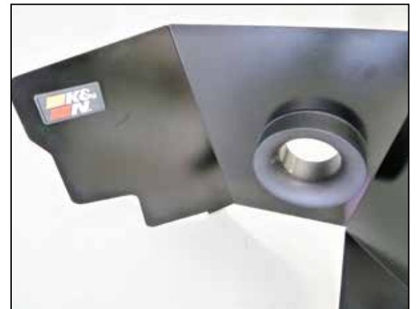
10. Install the filter adapters and K&N badges onto the heat shields using the provided hardware.