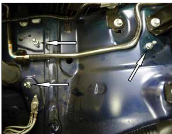
8. Remove the three air filter housing mounting studs from both the left and right sides.