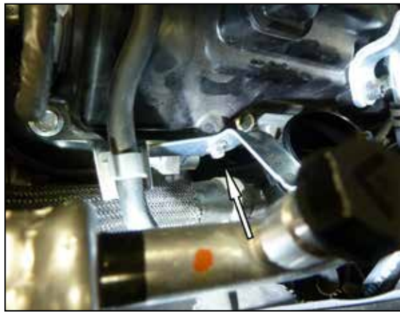
7. Remove the bolt that secures the driver side intake tube mounting bracket and then remove the bracket from the vehicle.