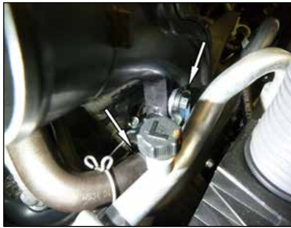
6. Disconnect the PCV hose from the driver side lower intake tube, Remove the intake tube mounting bolt then loosen the hose clamp securing the intake tube to the turbo inlet and remove the tube from the vehicle.