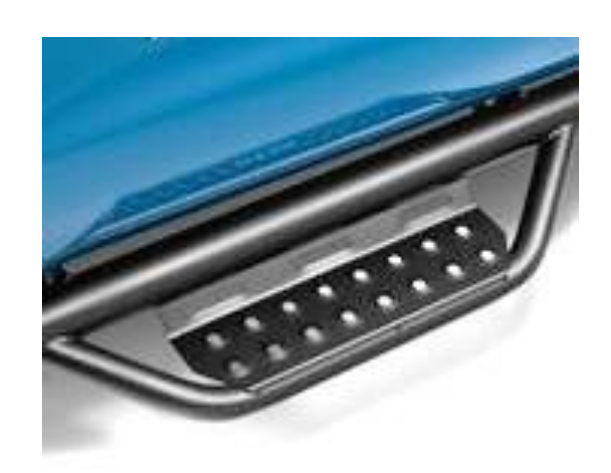
Step 1: Locate the driver side step rail.