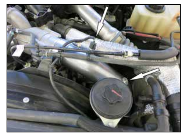
16. Reconnect the IAT sensor electrical connection and position the vent lines and harness.