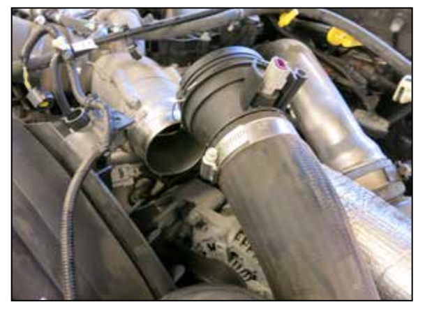
6. Separate the charge tube from the throttle body.