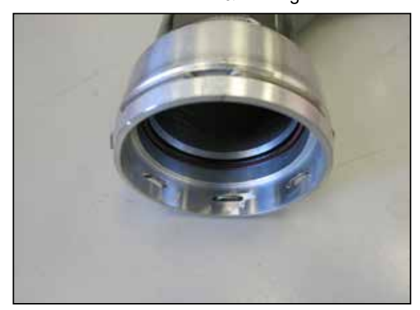
11. Remove the O-ring and retaining clip from the factory charge tube and install them into the K&N charge tube.