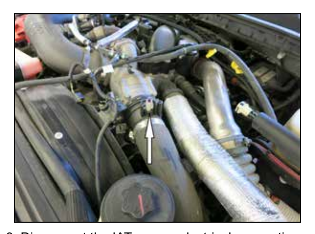
3. Disconnect the IAT sensor electrical connection and set the harness aside. Set the vent line aside for clearance while removing the factory charge tube.