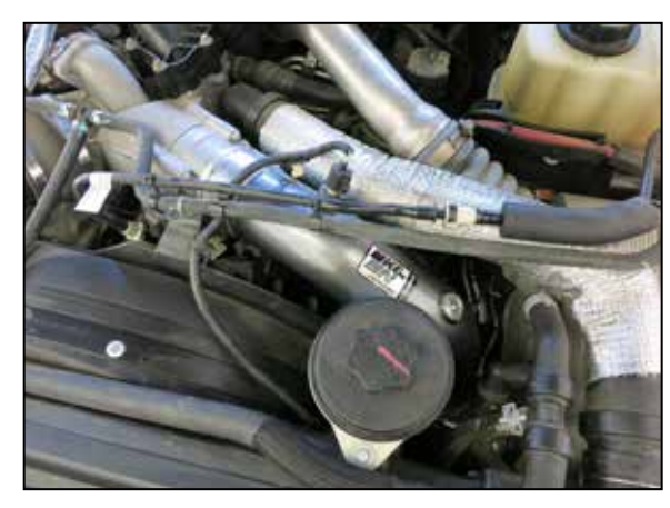
18. Reconnect the vehicle's negative battery cable. Double check to make sure everything is tight and properly positioned before starting the vehicle.

19. It will be necessary for all K&N® high flow intake systems to be checked periodically for realignment, clearance and tightening of all connections. Failure to follow the above instructions or proper maintenance may void warranty.