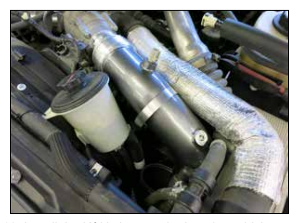
12. Install the K&N charge tube into the vehicle so the tube engages into the elbow coupler. NOTE: Apply spray lube to the tube/elbow connection to aid the insertion of the tube into the coupler as it is a tight fit.