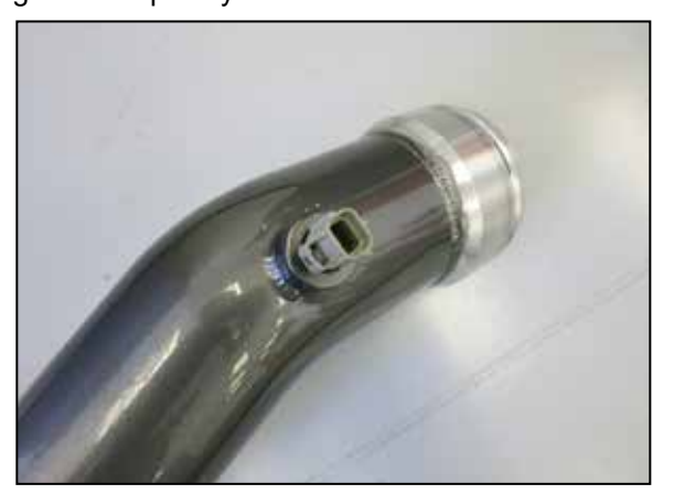
10. Remove the IAT sensor from the factory charge tube and install it into the K&N charge tube.