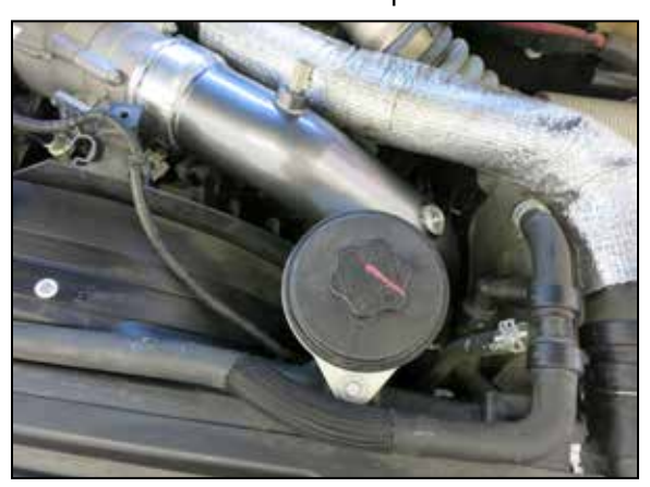
15. Reinstall the power steering reservoir and secure with the factory bolt.