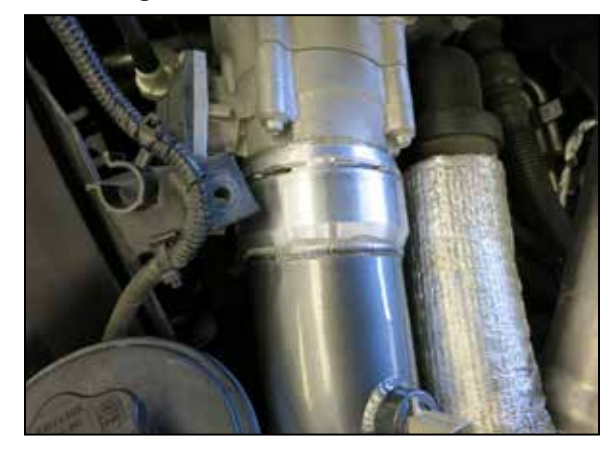
13. Connect the quick connector to the throttle body, push the coupler firmly until there is an audible "click" is heard. Pull back on the coupler to be sure the locking ring is engaged.