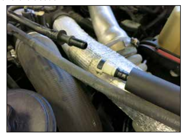
2. Disconnect the vent line at the quick connect fitting.

NOTE: Disconnecting the negative battery cable erases pre-programmed electronic memories. Write down all memory settings before disconnecting the negative battery cable. Some radios will require an anti-theft code to be entered after the battery is reconnected. The anti-theft code is typically supplied with your owner's manual. In the event your vehicles anti-theft code cannot be recovered, contact an authorized dealership to obtain your vehicles anti-theft code.