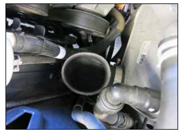
9. Install the provided elbow coupler onto the intercooler with the provided clamp but do not tighten completely.