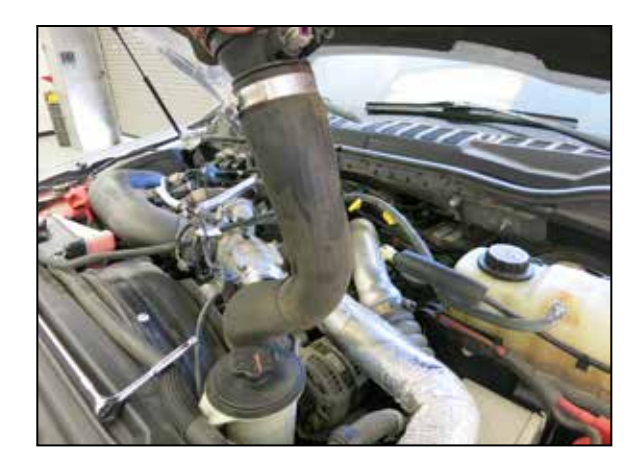
7. Separate the charge tube from the intercooler and then remove it from the vehicle.