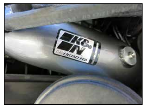
17. Install the provided 1/8" npt plug and K&N decal. Be sure to apply thread sealer to the npt threads.