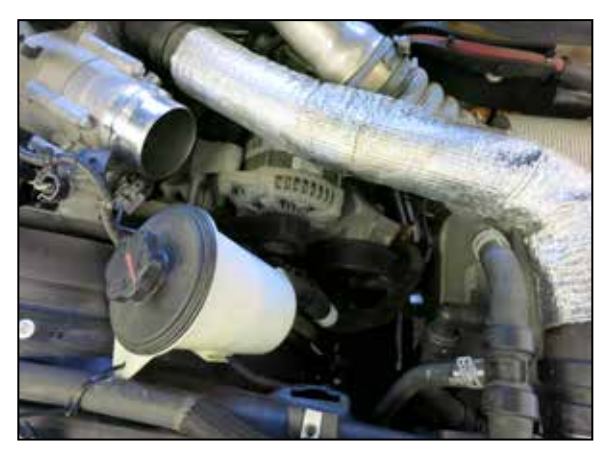
8. Remove the bolt that secures the power steering reservoir and set the reservoir to the side to aid with clearance during installation of the K&N charge tube.