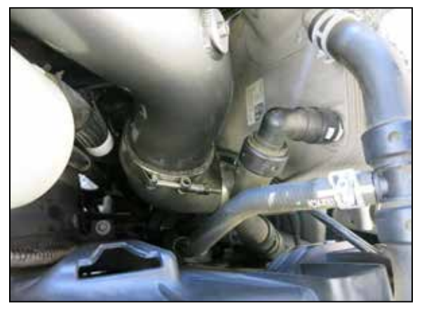
14. Adjust the tube and elbow coupler for best fit and then secure the hose clamps.