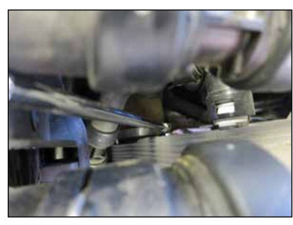
5. Using a 7mm socket, loosen the factory hose clamp that secures the charge tube to the inter cooler.