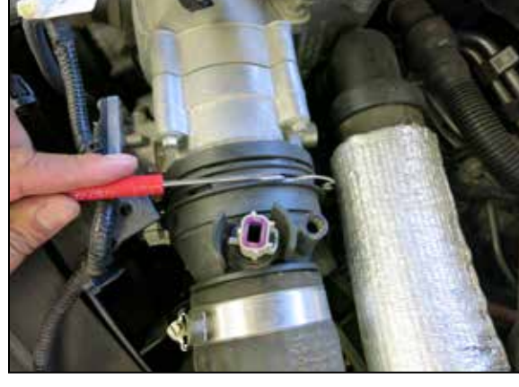
4. Using a small screwdriver or similar device, unlock the retaining clip that secures the factory charge tube quick connect coupler.