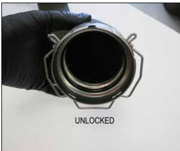
5. Release the retaining clips that secure the factory charge tube to the intercooler outlet and engine inlet by pulling them back. See photos. Remove the charge tube from the vehicle.