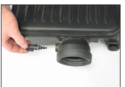
18. Twist the air temperature sensor counter clockwise and remove it from the stock intake plenum.