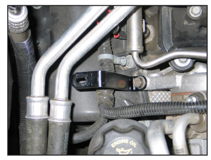
15. Install the tube mounting bracket onto the A/C compressor using the bolt removed in step #14 as shown.

NOTE: Due to vehicle manufacturing tolerances, check for proper clearance of the heater hoses at the tube mounting bracket assembly and adjust the heater hoses as necessary.