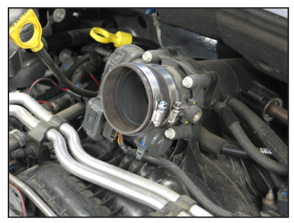
16. Install the provided silicone hose (084036) onto the throttle body and secure with the provided hose clamps.

NOTE: Due to vehicle manufacturing tolerances, check for proper clearance of the heater hoses at the tube mounting bracket assembly and adjust the heater hoses as necessary.