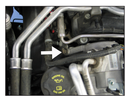
14. Remove the rear, lower A/C compressor mounting bolt shown.