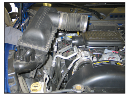
3. Disconnect the stock intake tube from the intake plenum. Then lift to remove to remove the airbox assembly from the vehicle as shown.

2. Loosen the hose clamp at the throttle body and the airbox mounting nut. Then disconnect the crankcase vent from the inline fitting.