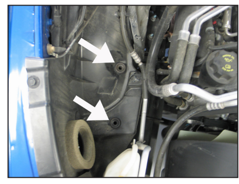
6. Pull the two airbox mounting grommets shown from the inner fender.