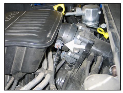
4. Depress the locking tab on the air temperature sensor electrical connection and disconnect the electrical connection.