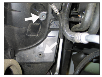
12. Install the two threaded inserts into the airbox mounting grommets location as shown.