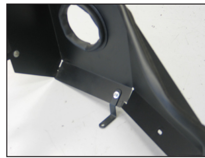
10. Install the "Z" bracket (010120) onto the heat shield with the provided hardware as shown.

9. Install the twist bracket (070702) onto the heat shield with the provided hardware as shown.