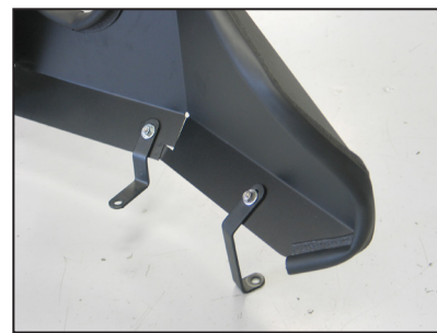
11. Install the "C" bracket (010118) onto the heat shield with the provided hardware as shown.