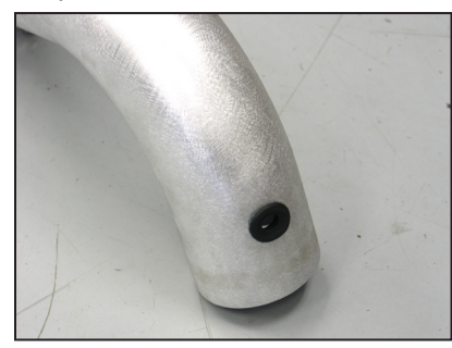
17. Install the provided grommet into the K\&N^{\otimes} intake tube as shown.