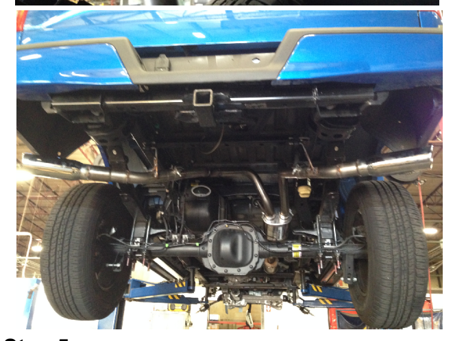
Step 5. To allow for the installation of a dual outlet system on a single outlet vehicle you will have to mount the supplied Hanger Brackets to existing holes in the factory frame rails using the supplied fasteners (8mm bolt and panel nut) as shown in the photos. Once completed you can now slide the Tailpipe assemblies onto the Over Axle pipes and fasten with the supplied 2.50" clamps and mount the hangers to the installed hanger brackets using the supplied rubbber insulators.