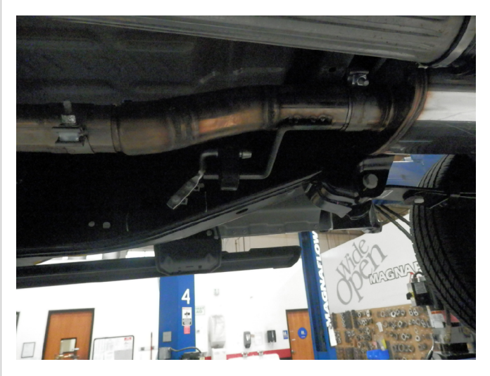
Step 2. Install the new system by attaching the Inlet Pipe Assembly to the resonator outlet pipe using the existing clamp. Locate the welded hanger to the rubber insulator. Leave all clamps and fasteners loose for final adjustment of the complete system once installed.