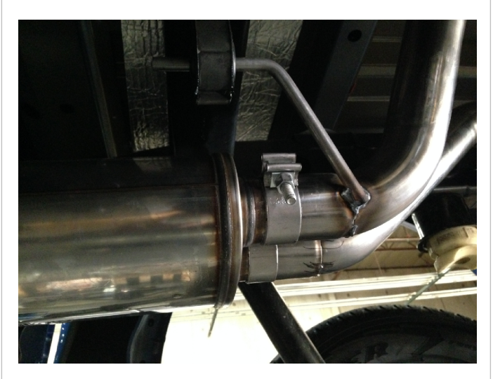
Step 4. Install both the Over Axle Pipes using the supplied 2.50" clamps. Locate the welded hanger to the OEM rubber insulator.

MAGNAFLOW: 1901 Corporate Centre Dr - Oceanside, CA 92056 | 1(800)990-0905 Technical Support: 1(800) 959-9226 | Email: moreinfo@magnaflow.com