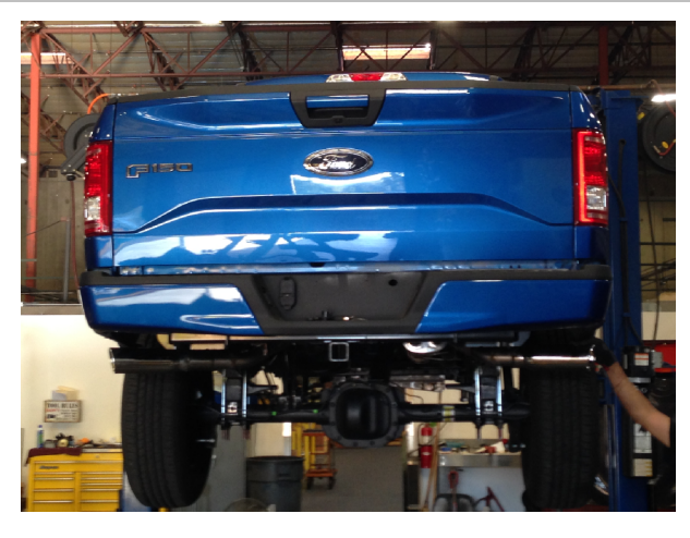
Step 6. Once a final position has been chosen for the new exhaust system, evenly tighten all clamps from front to rear using the torque specifications on page one of the instructions. Inspect all fasteners after 25-50 miles of operation and re-tighten if necessary.

MAGNAFLOW: 1901 Corporate Centre Dr - Oceanside, CA 92056 | 1(800)990-0905 Technical Support: 1(800) 959-9226 | Email: moreinfo@magnaflow.com