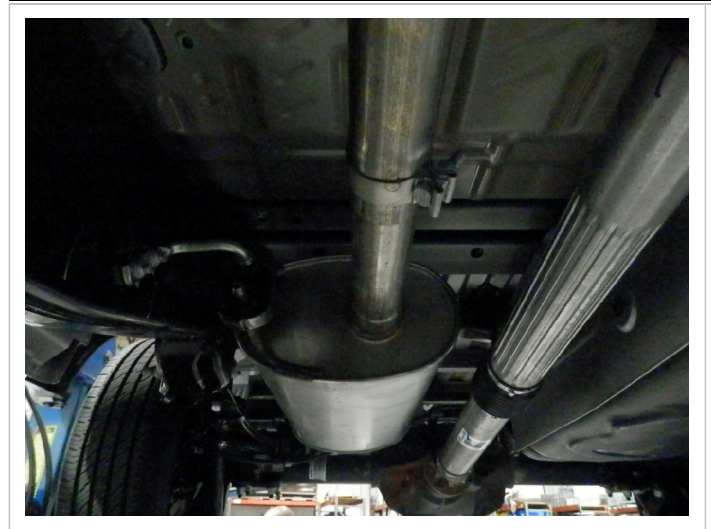
Step 1. The new exhaust system requires that you remove the spare tire from the vehicle. To remove the OEM exhaust system, loosen the clamp attaching the system inlet pipe to the resonator outlet pipe. Disengage all welded hangers from the OEM rubber insulators. Do not discard the OEM clamp or damage the rubber insulators as they will be needed to mount your new MAGNAFLOW system.