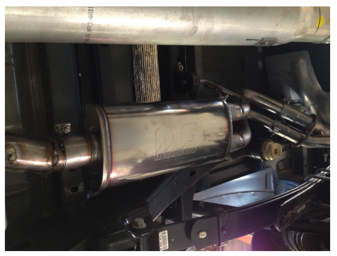
Step 3. Install the Muffler Assembly to the Inlet Pipe Assembly using the supplied 3.00" clamp.