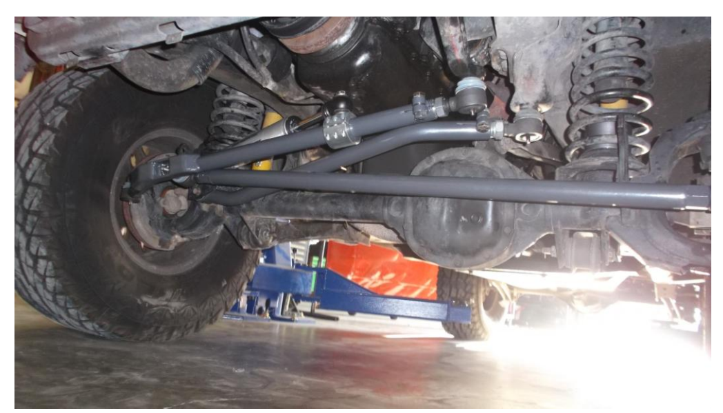
Figure 2. Installed Track Bar