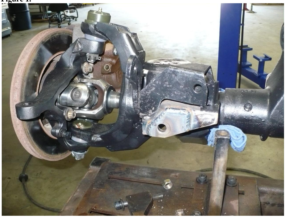
Figure 1. Axle Side Track Bar Mount Gusset Installed