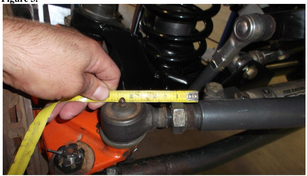
Figure 3. Maximum Adjustment Length Example

b. NOTE – Do not extend adjuster past 3.25" from end of track bar to center of zerk fitting. See Figure 3.