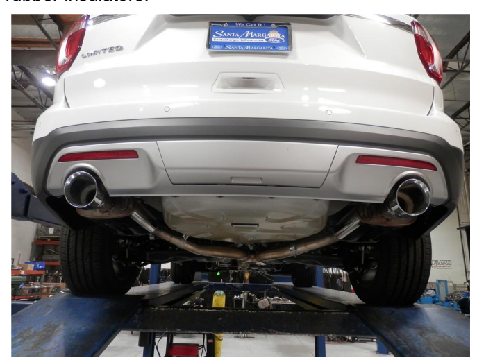
Step 4. Once a final position has been chosen for the new exhaust system, evenly tighten all clamps from front to rear using the torque specifications on page one of the instructions. Inspect all fasteners after 25-50 miles of operation and re-tighten if necessary.