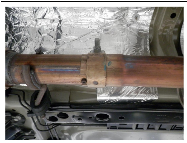
Step 1. To remove the OEM exhaust system loosen the clamp fastening the inlet pipe to the Catalytic Converter outlet. Working front to rear disengage all welded hangers from the rubber insulators and remove the system. Do not discard the or damage the rubber insulators as they will be used to mount the new system.