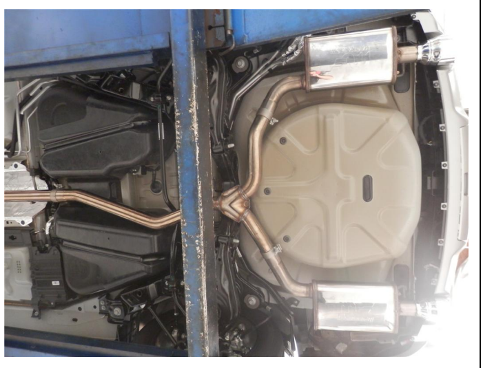
Step 3. Next loosely attach the Y-Pipe Assembly and both Muffler Assemblies using the supplied 2.50" clamps. Engage all welded hangers to the rubber insulators.