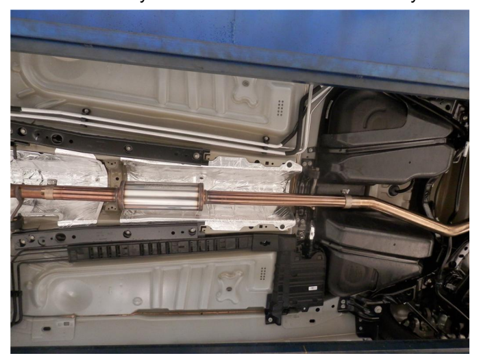
Step 2. Begin installation of the new system by fastening the Resonator Assembly inlet to the outlet of the catalytic converter using the supplied 2.25" band clamp. Please be sure to align the locating peg with the notch in the pipe. Leave all clamps loose for the final adjustment of the complete system.