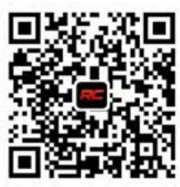
Download QR Code

Download RC Connect App for IOS and Android devices