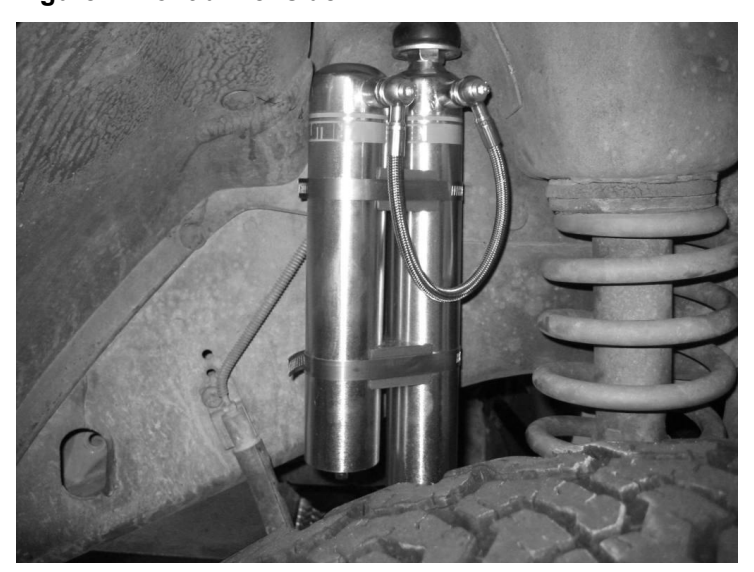
Figure 2. front passenger side