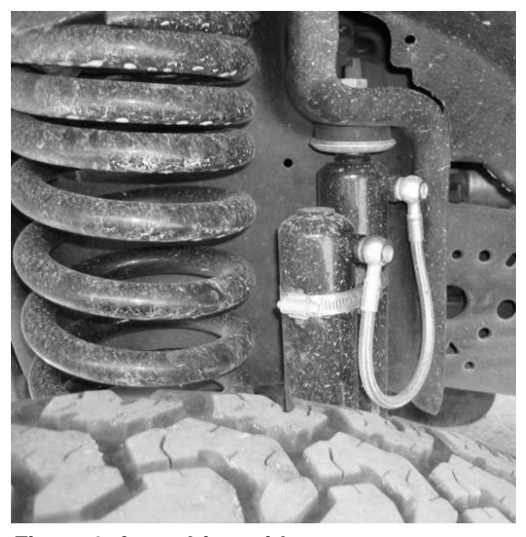
Figure 3. front driver side

Note: The shocks and hardware depicted herein may differ slightly in appearance from the supplied components.