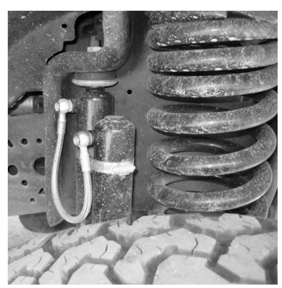
Figure 4. front passenger side