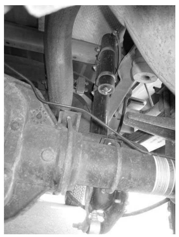
Figure 3. rear driver side