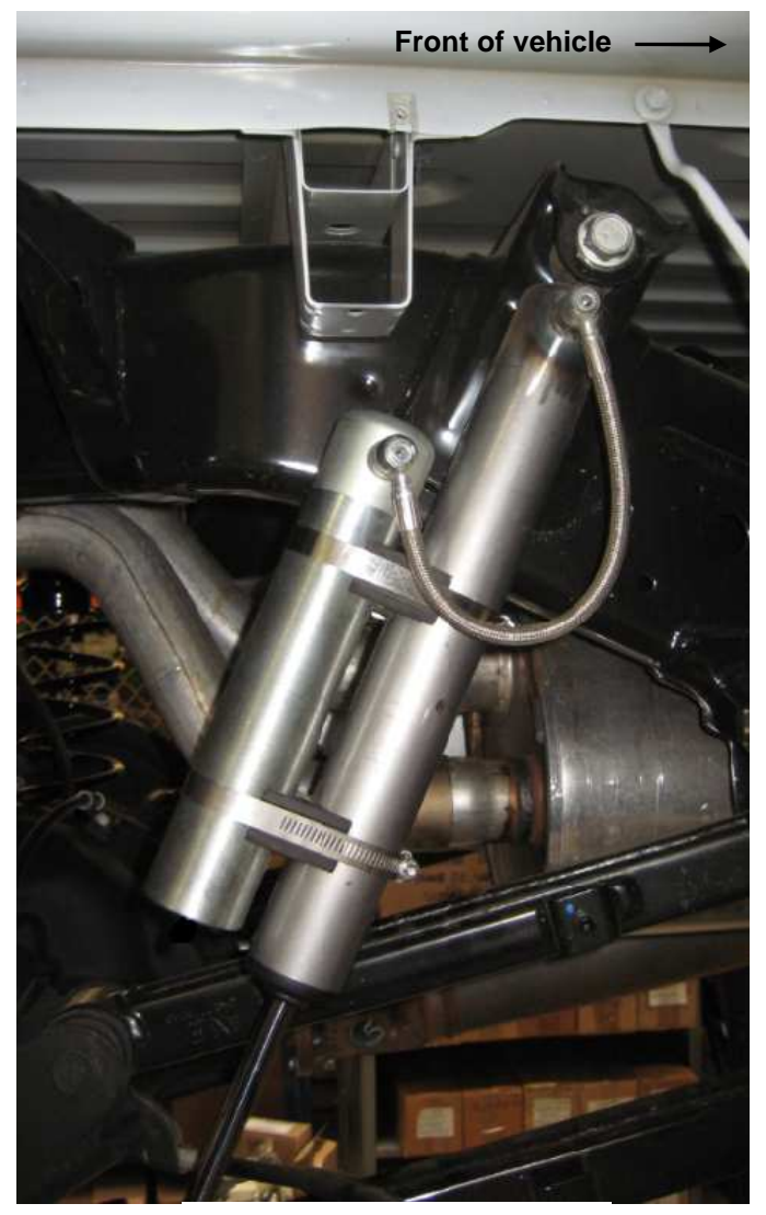
Figure 1. passenger side