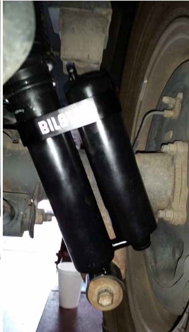
Figure 3 – LEFT REAR (looking towards the rear)

Note: The shocks depicted herein differ slightly in appearance from the supplied components.