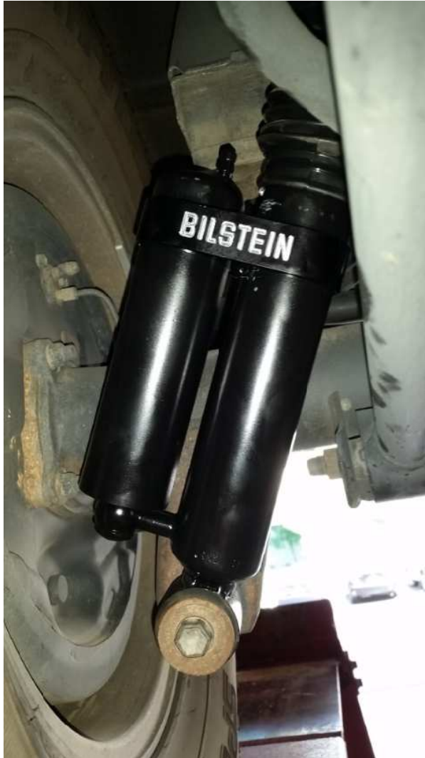
Figure 2 – RIGHT REAR (looking towards the rear)