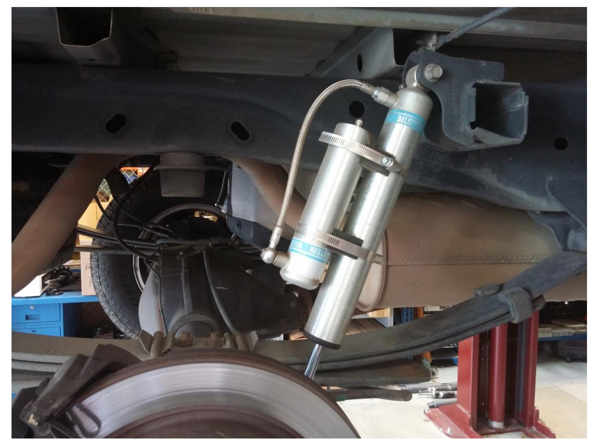
Figure 1. Reservoir placement for both sides