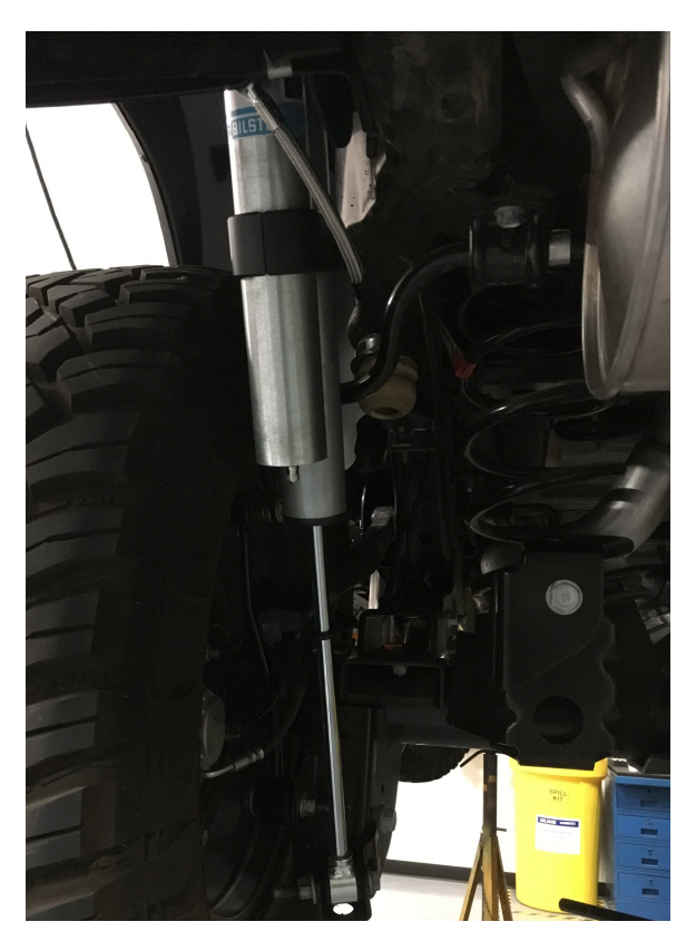
Figure 2. rear driver side