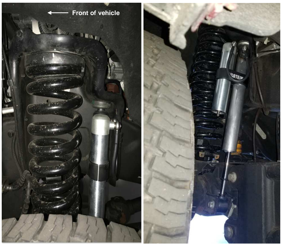
Figure 1. Driver Side