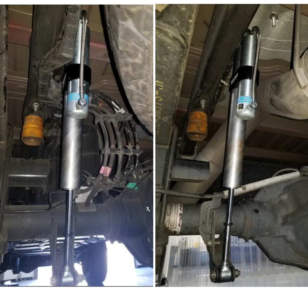
Figure 4. Rear Driver Side (View from rear)