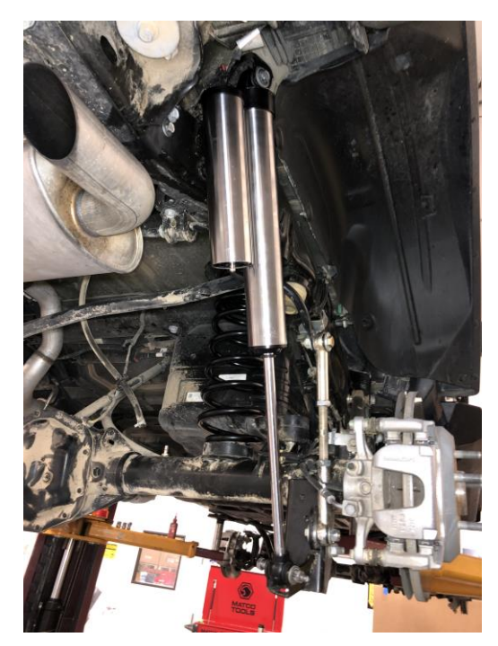
Figure 3 - Rear Passenger Side