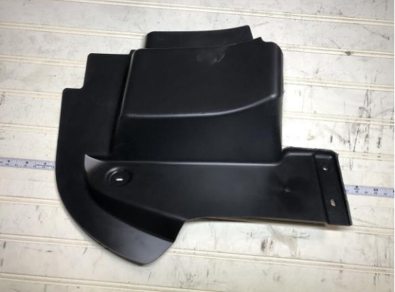
Figure 6 - Right Side After Trimming