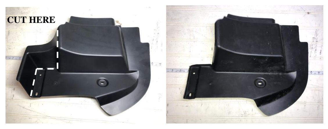
Figure 7 – Left Side Before Trimming