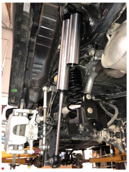
Figure 2 - Rear Driver Side