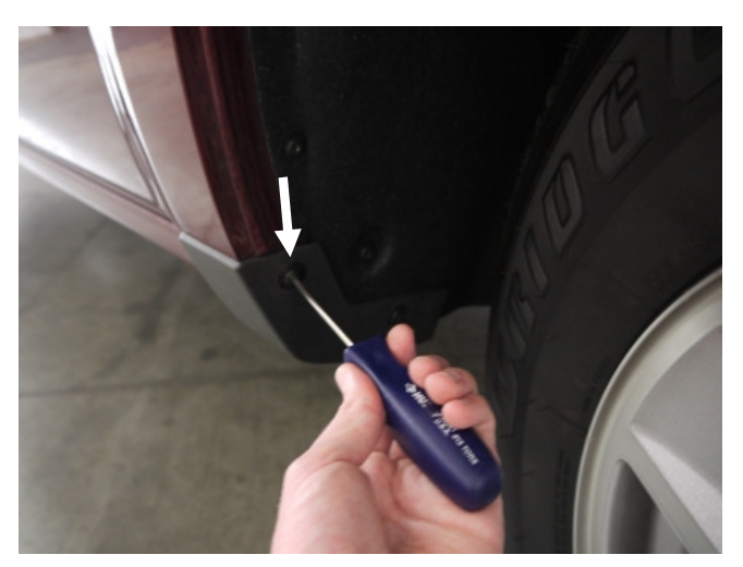
STEP 6: Using #15 Torx head screwdriver remove upper screw from the front factory mudguard. Maintain screws for re-install.