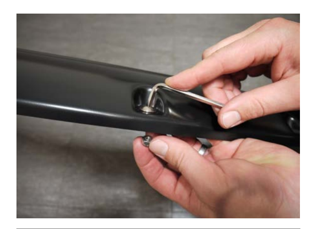
STEP 1: Attach the 10 bolts and nuts to each Fender Flare using a 3/16" Allen key and a 10.0mm wrench/socket. (wrench /socket and Allen key not supplied). Ensure inside of Fender Flares where the rubber seal is attached is clean, using the alcohol wipes provided. Wipe away any residue with a dry clean cloth.

PAINTING INSTRUCTIONS – If Fender Flares are being painted; do not install edge extrusion until painting is complete. Prior to painting, clean all surfaces to be painted using clean water and a mild detergent, do not use lacquer thinner or any solvent based products. Wipe completely dry. Best results will be achieved by wiping the areas to be painted with a tack rag just prior to painting. Most automotive paints can be applied directly to the Fender Flares, however some may require a primer (check paint manufacturer specifications). Good adhesion will be achieved without sanding. Select a paint (and primer if necessary) that is suitable for rigid plastics PMMA (Acrylic). If using a paint system that requires baking, do not expose the product to temperatures above 70°C (158°F). Do not fit the extrusion or any of the hardware to the Fender Flares until the paint is completely dry.