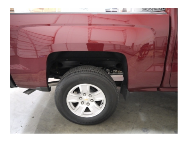
STEP 14: Clean the body areas where the Fender Flares will make contact. Ensure fenders are dry prior to install.