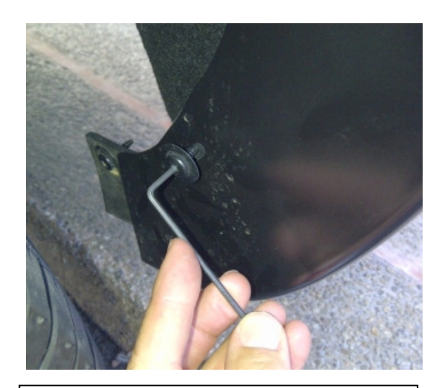
STEP 18: Using #15 Torx head screwdriver reinstall the upper screw from the rear factory mudguard through the slot in the Fender Flare. Ensure all fixing points are tight and secure and that the rubber seal is flush neatly against the vehicle body.