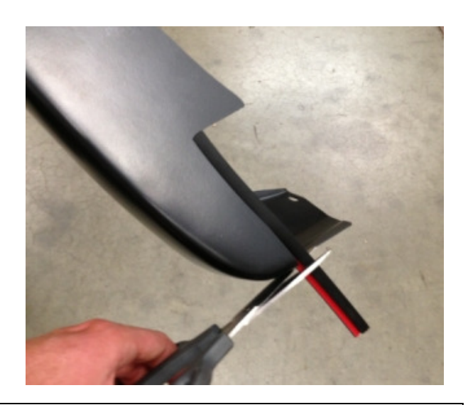
STEP 13: Attach rubber seal to the bottom front corner of Fender Flares. Peel back 1" of the adhesive backing and position on the Fender Flare. Attach the seal to the Fender Flare, ensure pressure is used to secure rubber seal to Fender Flare edge. Trim excess rubber seal and discard.