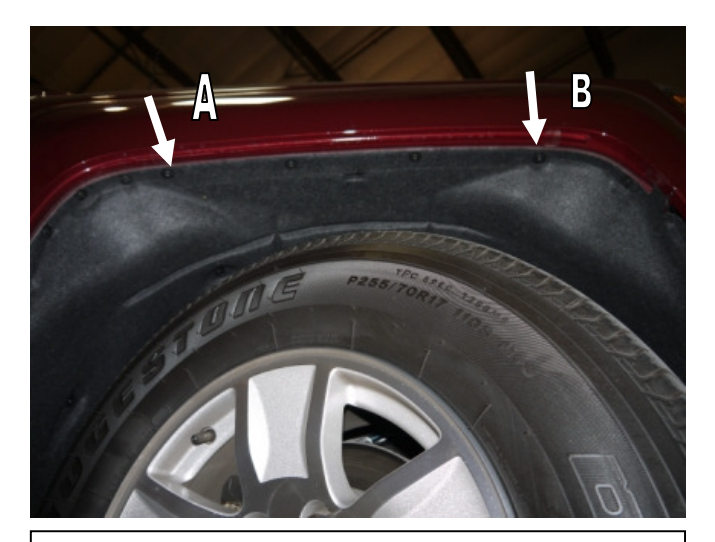
STEP 5: Place Fender Flare on the vehicle into the position of best fit. Note where the slots in Fender Flare at positions A and B align with the existing screws in the vehicle wheel arch. Remove Fender Flare. Remove the existing vehicle screws in location A and B using #15 Torx head screwdriver. Maintain screws for re-install.