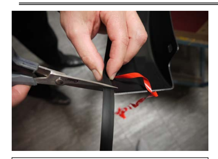
STEP 3: Trim any excess rubber seal and discard.

Bolt-On/Rugged Fender Flares Chevy Silverado 1500/2500/3500 (14-16) FIT-FF760