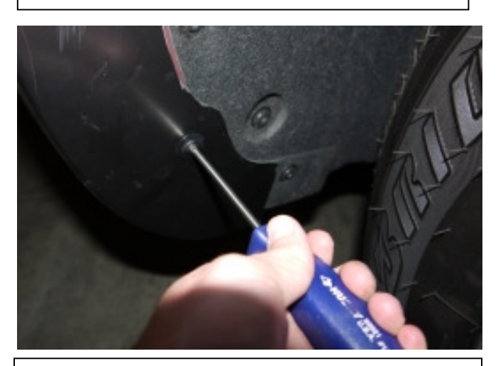
STEP 9: Re-install factory screw in the mudguard using #15 Torx head screwdriver through the slot in the Fender Flare.