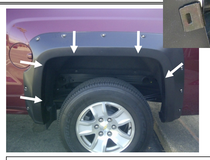
STEP 16: To secure the Fender Flare to the body, apply upward tension on Fender Flare to the vehicle fender when installing the black metal clips. Slide the clips over the Fender Flare and the inner wheel arch lip in the five locations shown. Position the clip so that the barb in the clip locates in the slot of the Fender Flare.