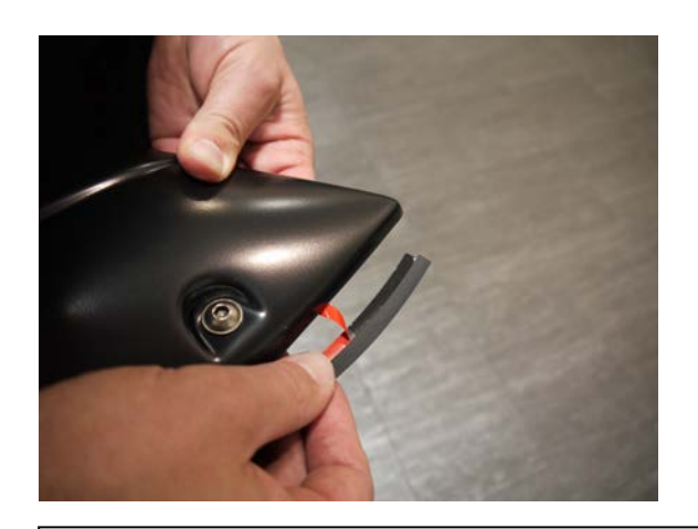
STEP 2: Attach the included rubber seal to the Fender Flares. Peel back 2" of the adhesive backing and position on the Fender Flare. Attach the seal to the Fender Flare, peeling back a few inches at a time. Ensure pressure is used to secure rubber seal to Fender Flare edge. Attach rubber seal along all areas the Fender Flare will make contact with the vehicle body.