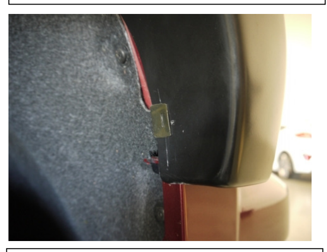
STEP 10: To secure the front slot in the Fender Flare to the body, take the black metal clip and slide it over the Fender Flare and the inner wheel arch lip. Position the clip so that the barb in the clip locates in the slot of the Fender Flare. Ensure all fixing points are tight and secure and that the rubber seal is flush neatly against the vehicle body.