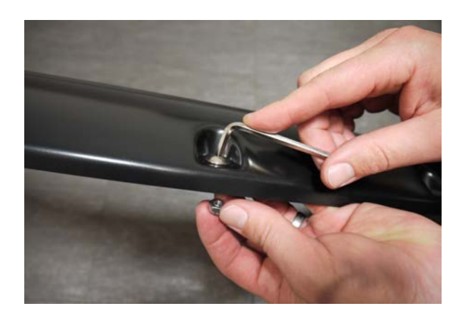
STEP 11: Attach the 12 bolts and nuts to each Fender Flare using a 3/16" Allen key and a 10.0mm wrench/socket. (wrench /socket and Allen key not supplied). Ensure inside of Fender Flares where the rubber seal is attached is clean, using the alcohol wipes provided. Wipe away any residue with a dry clean cloth.