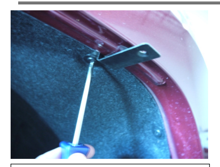
STEP 7: Apply clear tape to the inside edge of the fender wheel arch in front of positions A and B (step 5) over mastic sealant. Install the large brackets in positions A and B (step 5) aligning the slot in the bracket with the vacant holes from the factory screws in the vehicle wheel arch. Ensure clips are positioned over the clear tape. Reinstall the factory screws in location A and B using a #15 Torx head screwdriver.

Bolt-On/Rugged Fender Flares Chevy Silverado 1500/2500/3500 (14-16) FIT-FF760