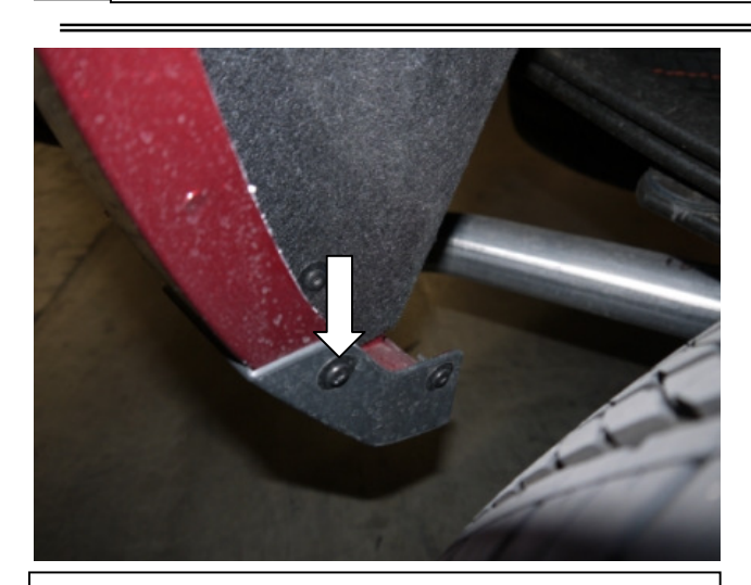
STEP 15: Using #15 Torx head screwdriver remove upper screw from the rear factory mudguard. Maintain screws for re-install.

Bolt-On/Rugged Fender Flares Chevy Silverado 1500/2500/3500 (14-16) FIT-FF760