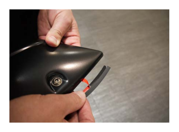
STEP 12: Attach the included rubber seal to the Fender Flares. Peel back 2" of the adhesive backing and position on the Fender Flare. Attach the seal to the Fender Flare, peeling back a few inches at a time. Ensure pressure is used to secure rubber seal to Fender Flare edge. Attach rubber seal along all areas the Fender Flare will make contact with the vehicle body. Trim excess rubber seal.