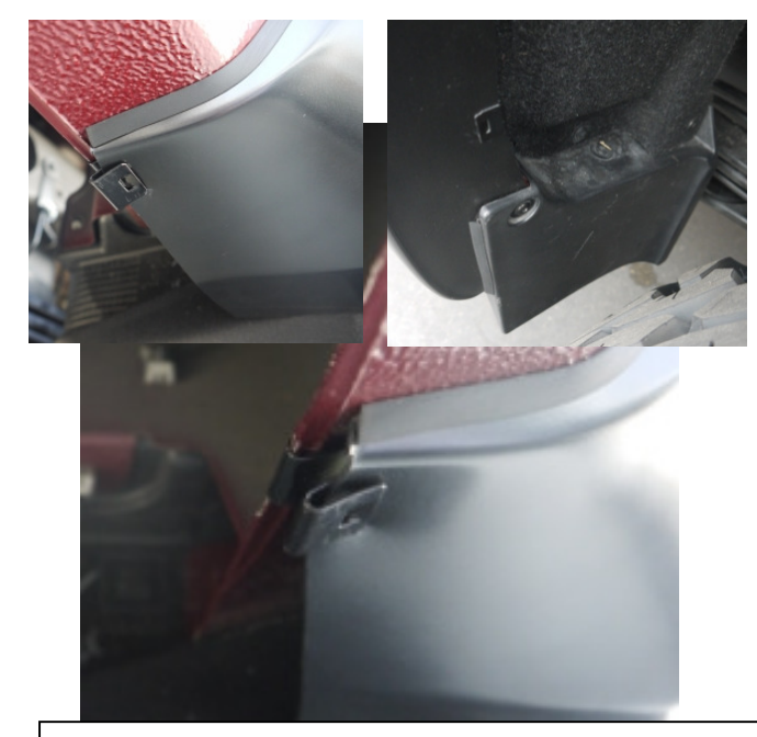
STEP 17: Slide the top edge of rear front mudguard cut out behind the factory mudguard. Install the E shape clip so that the clip slides over the inner sheet metal lip and is in line with the slot in the underside of Fender Flare. To secure the clip to Fender Flare apply inward tension on Fender Flare to the vehicle fender when installing the E clip, position the clip so that the barb in the clip locates in the slot of the Fender Flare.