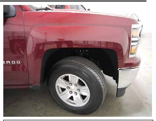
STEP 4: Clean the body areas where the Fender Flares will make contact. Ensure fenders are dry prior to install. Turn tires outward for Fender Flare installation.