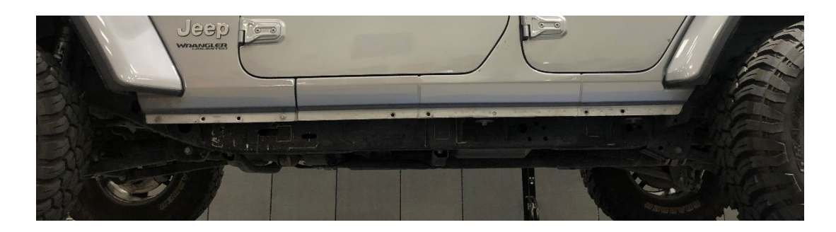
<u>Step 3.</u> With an assistant or use of jack stands, install the slider using the supplied M8x30mm hex bolt (x4) to the upper threaded mounts first and loosely tighten for now.