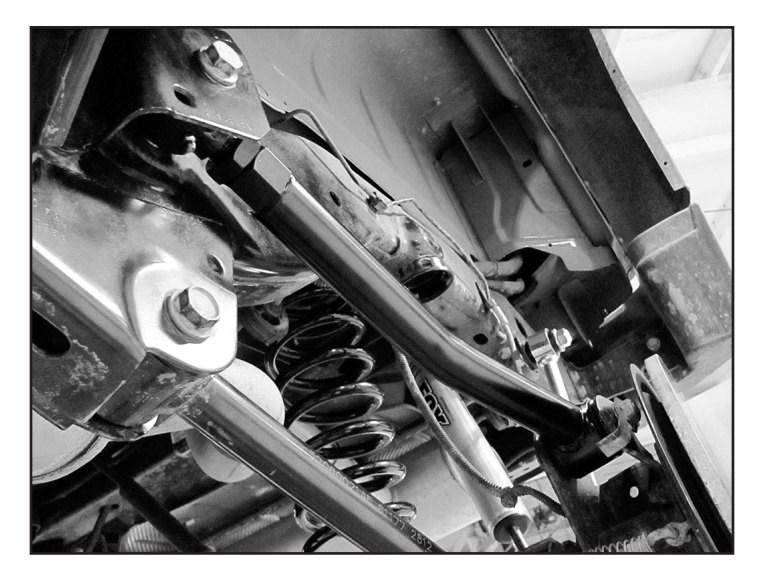
HINT: If mounting bolt is difficult to install due to misalignment of Control Arm bushing with mounting bracket, either (1) adjust height of axle housing with hydraulic jack, (2) move axle housing into position with a heavy-duty ratchet strap, or (3) temporarily disconnect track bar until mounting holes align.