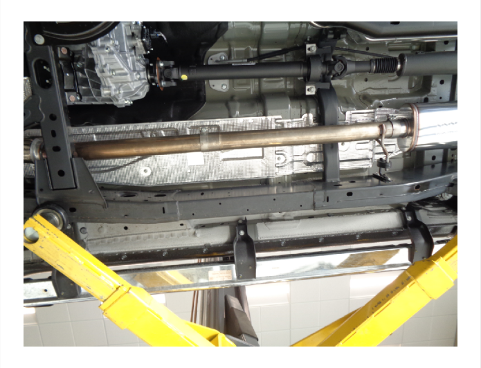
Step 3. Next, attach the Extension Pipe Assembly and the Muffler using the supplied 3.00" clamps and engaging the hanger into the rubber insulator.