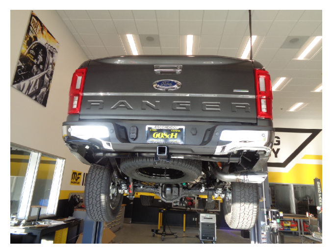
Step 6. Once a final position has been chosen for the new exhaust system, evenly tighten all clamps from front to rear using the torque specifications on page one of the instructions. Inspect all fasteners after 25-50 miles of operation and re-tighten if necessary.