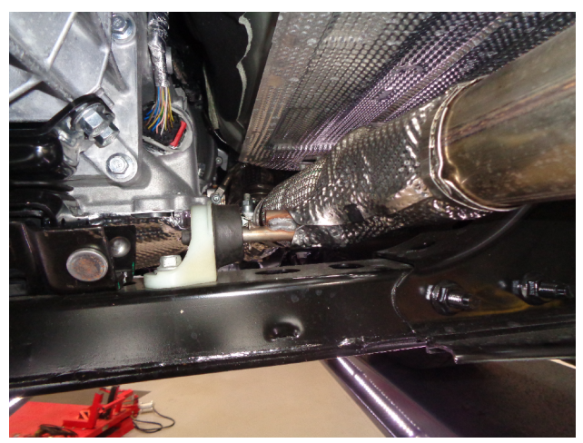
Step 1. To remove the OE exhaust system begin by loosening the clamps at the outlet of the catalytic converter and the inlet of the muffler. With the exhaust supported disengage the welded hangers from the rubber insulators and remove the system. Do not damage or discard the rubber insulators as they will be install the MagnaFlow system.