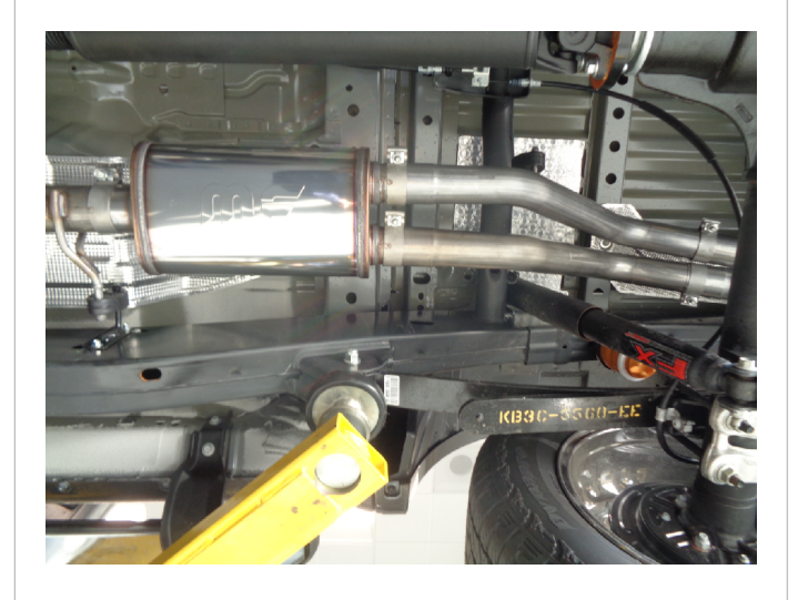
Step 4. Attach the Driver and Passenger Over Axle Pipes to the Muffler Assembly using the supplied 2.50" clamps and engaging the welded hanger.