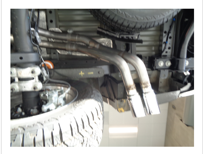
Step 5. Finish the installation by attaching the Tail Pipe Assembly to the Over Axle Pipes using the supplied 2.50" clamps and fitting the hanger into the rubber insulator.