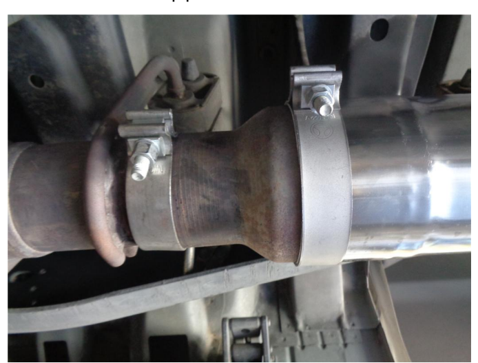
Step 3. Begin installation by loosely attaching the Inlet Pipe Assembly to the OEM flange outlet using the OEM hardware (6.7L), or loosely attach the Inlet Adapter to the DPF outlet using the supplied clamp (6.4L). Loosely attach the Extension Pipe, if needed, using the supplied clamp.

Step 2. Determine the overall length of the Inlet Pipe Assembly and the Extension Pipe, if required using the chart. The measurements are what needs to be cut from the outlet end of the pipes.