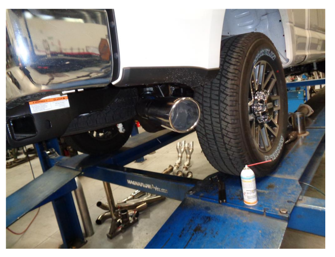
Step 7. Once a final position has been chosen for the new exhaust system, evenly tighten all clamps from front to rear using the torque specifications on page one of the instructions. Inspect all fasteners after 25-50 miles of operation and re-tighten if necessary.