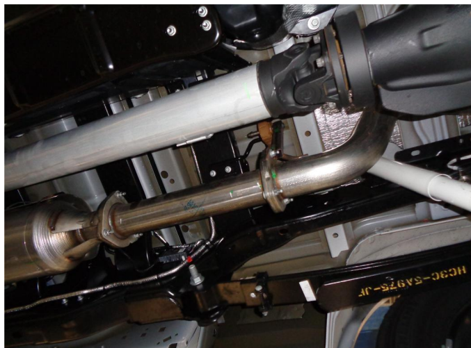
Step 1. To remove the OEM exhaust remove the O2 sensor from the over axle pipe (6.7L only). Unbolt the extension pipe assembly from from the DPF outlet flange (6.7L) or loosen the band clamp attaching the inlet pipe (6.4L). Working front to rear disengage all welded hangers from the rubber insulators. Be sure to retain all mounting hardware as it will be needed to install your new MAGNAFLOW system.