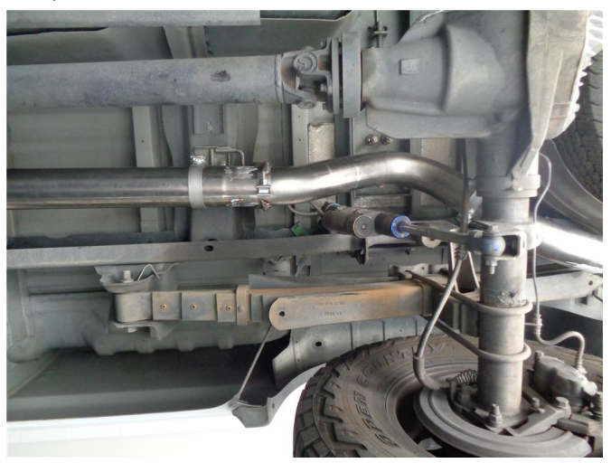
Step 4. Loosely install the Over Axle Pipe Assembly using the supplied clamp. Remove the sensor plug for 6.7L application. Loosely slip the Hanger Clamp Assembly over the pipe and locate the welded hangers to the rubber insulators.