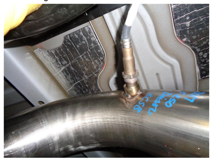
Step 6. Reattach the O2 sensor (6.7L only).