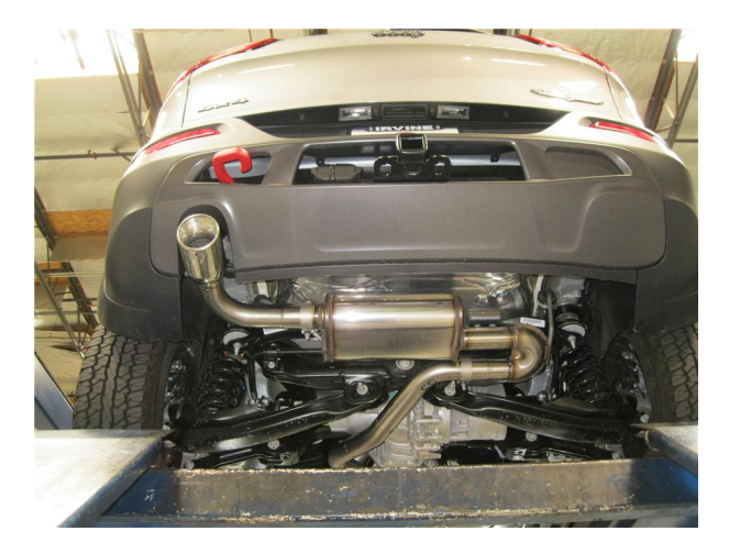
Step 5. Next use the supplied 2.50" clamps to attach the Muffler Assembly to the Mid Pipe and the Tail Pipe Assembly to the Muffler. Fit hangers into rubber insulators.