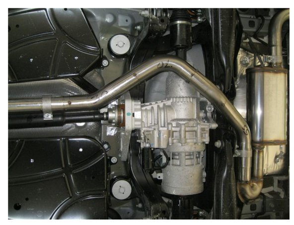
Step 4. Next use the supplied 2.50" clamp to attach the Mid-Pipe to the Resonator Assembly.