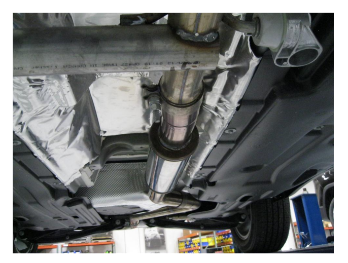
Step 3. Begin installation of your new MAGNAFLOW system by attaching the Resonator Assembly to the factory outlet. Keep all fasteners and clamps loose until final adjustment.