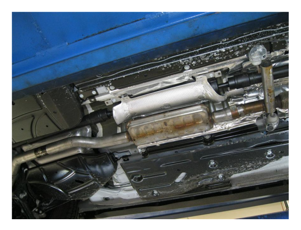
Step 1. Begin removal of the OEM exhaust system by loosening the clamp behind hanger brace (in front of the factory resonator).