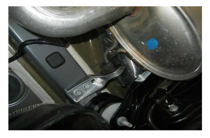
Step 2. Disengage hangers from rubber insulators and remove the OEM exhaust.